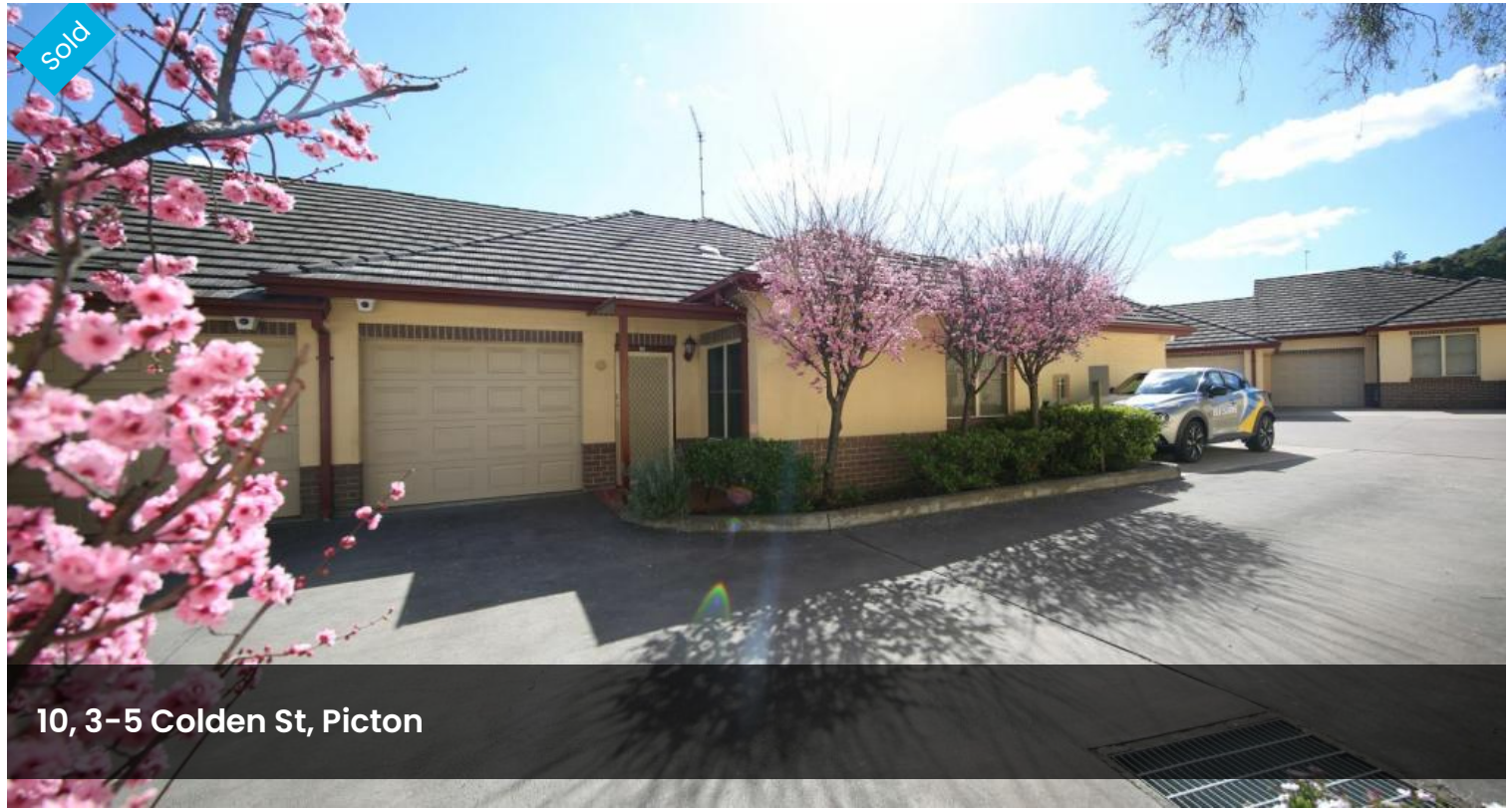
10, 3-5 Colden St, Picton